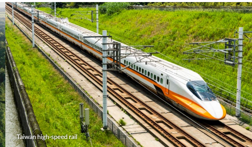
Taiwan high-speed rail