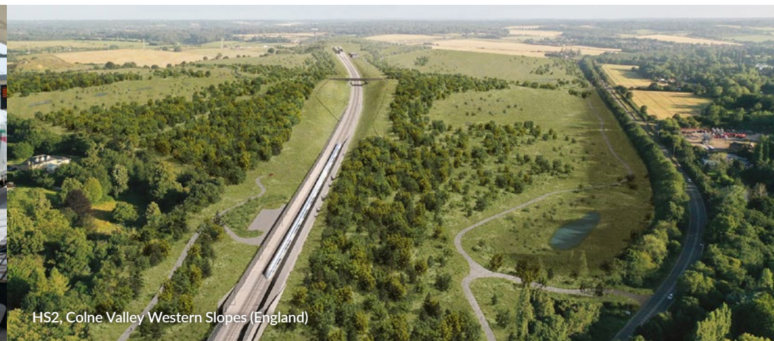
HS2, Colne Valley Western Slopes (England)