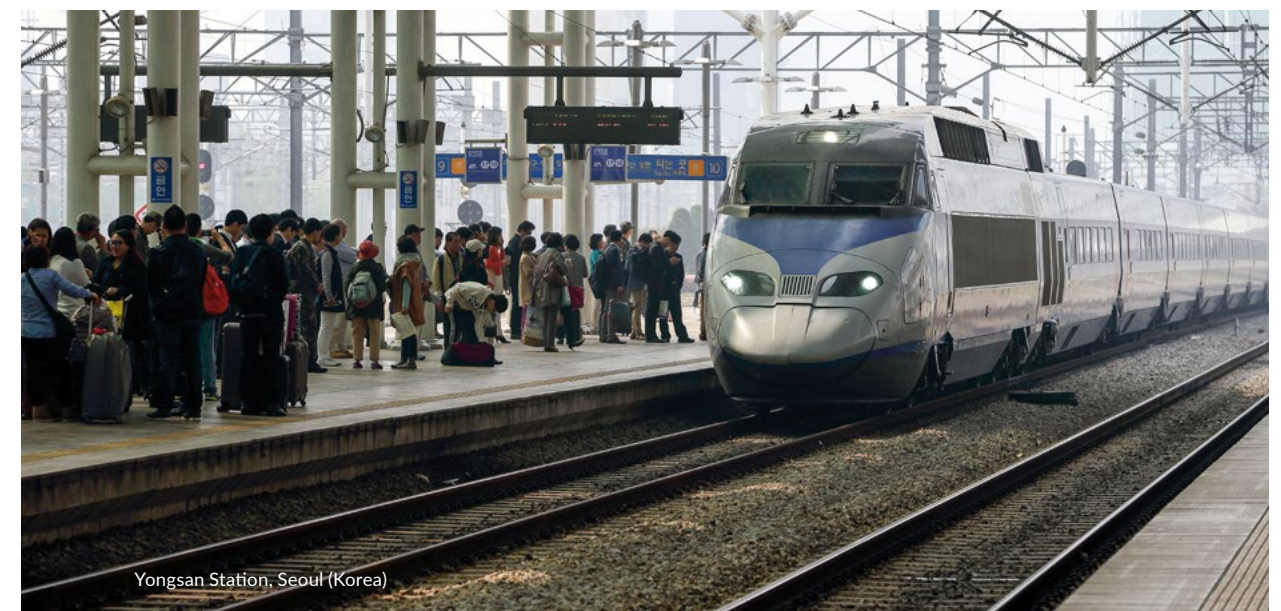
Yongsan Station, Seoul (Korea)