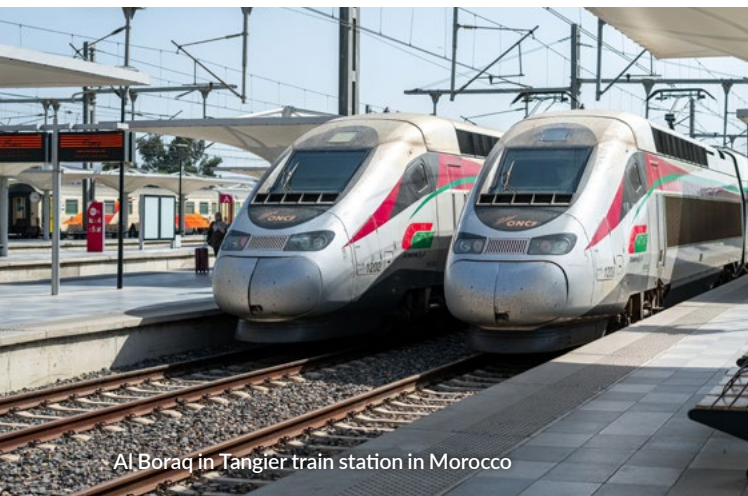
Al Boraq in Tangier train station in Morocco