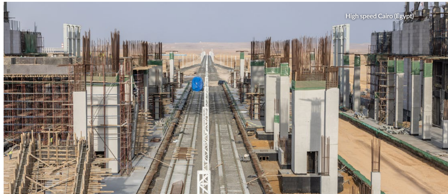
High speed Cairo (Egypt)