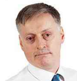
By David Connolly

Achieving 'net zero' by 2050 is no easy task, particularly when many local authorities are struggling with limited resources. Yet the UK is legally bound to 2050 and with the Department of Transport (DfT) guidance on Quantifiable Carbon Reduction imminent, it is clear that decarbonisation must be at the heart of transport planning and every Local Transport Plan. So how can local authorities identify which proposed transport interventions will actually cut carbon and by how much? This is where the Decarbonisation Policy Playbook comes in.